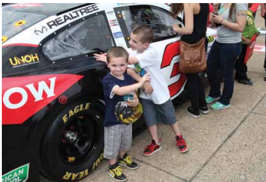
The Richard Childress Racing No. 3 Dow Chevrolet SS from the NASCAR Sprint Cup Series gets kids excited. The car was displayed at Dow's festival exhibit, as well as at four Dow sites and eight Philadelphia area community locations. The exhibit showcased the science, mechanics and safety of racing — and offered attendees the opportunity to try an on-site race simulator.