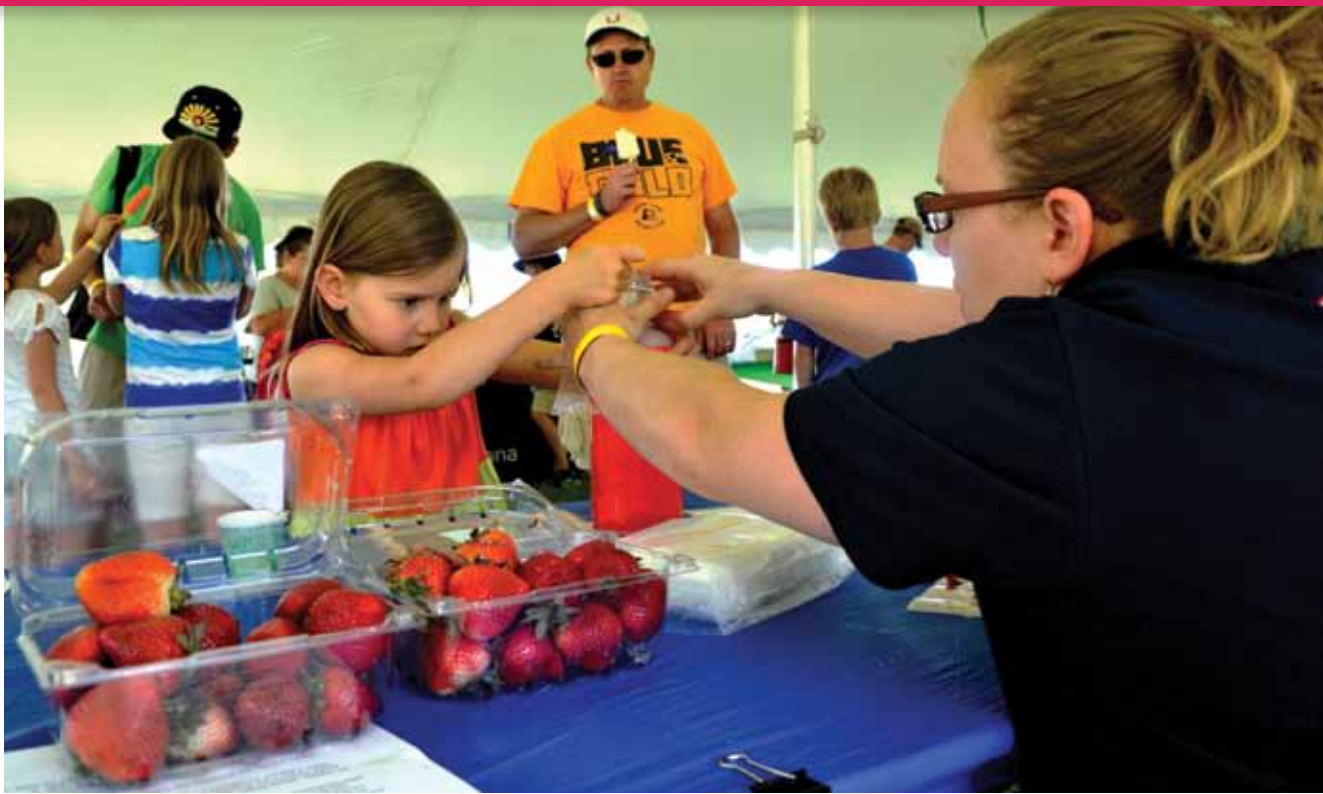
Visitors to the Conner Prairie Curiosity Fair in Fishers, Ind., get hands-on understanding of science concepts from Science Ambassadors volunteers.