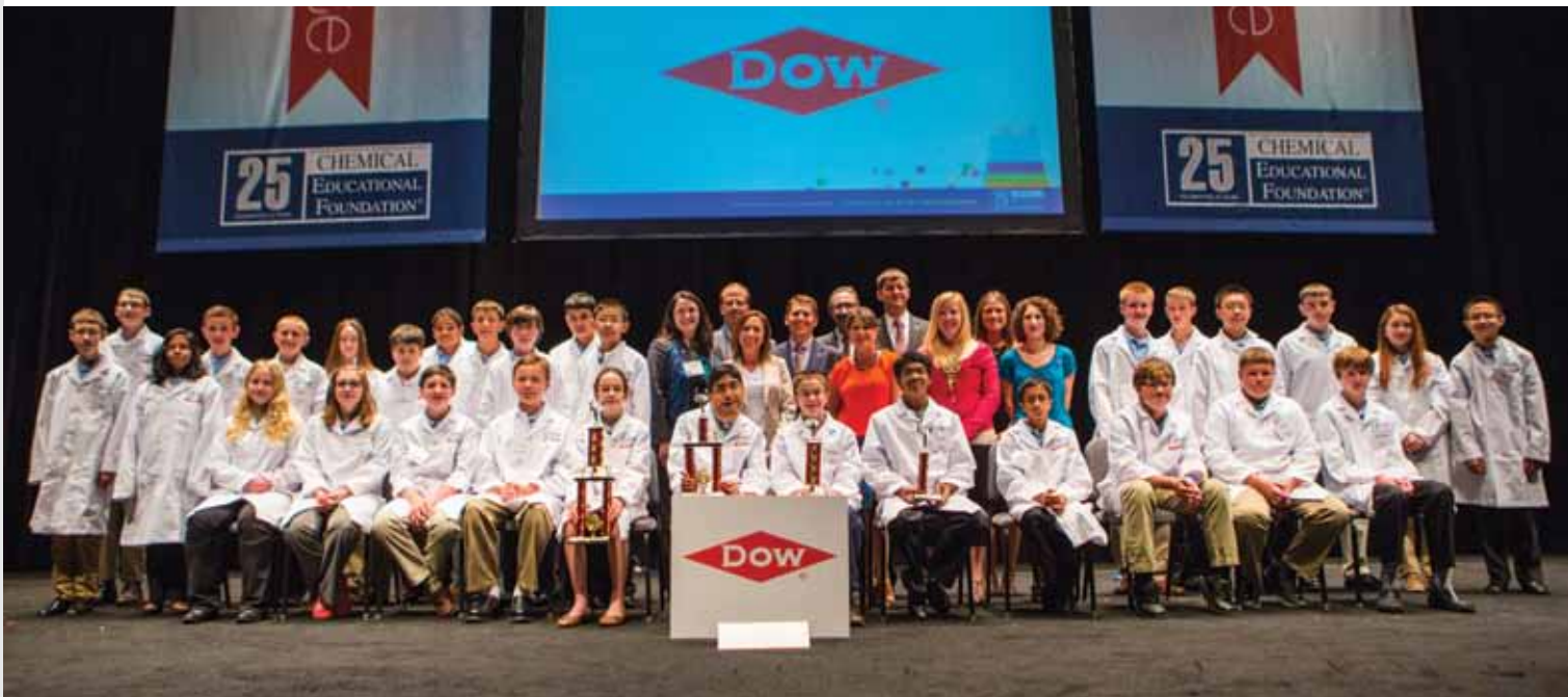
Participants in the 2014 You Be The Chemist National Championship gather after the competition.

The annual event included approximately 20 interactive displays as well as food, musical acts, celebrity visits from Miss Louisiana USA 2014 and Miss Louisiana Teen USA 2014, relays and sporting contests. In addition, a nature trail tour was organized during which visitors followed the 1,600-foot boardwalk trail, visiting the Dow Palmetto Outdoor Classroom, the Dow Bayouside Outdoor Classroom, and other displays that shared the history and future of Wetland Watchers Park. ■