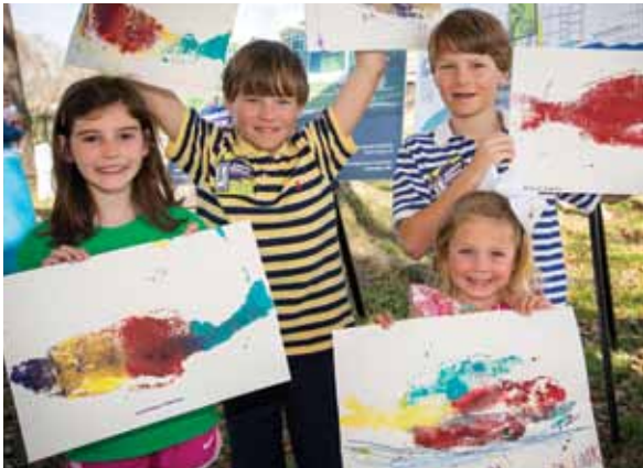
To celebrate the announcement of Dow’s sponsorship of the Fish Tales Learning Zone, children take part in Gyotaku, the art of Japanese fish painting that encourages exploration of senses and discovery of colors and textures.