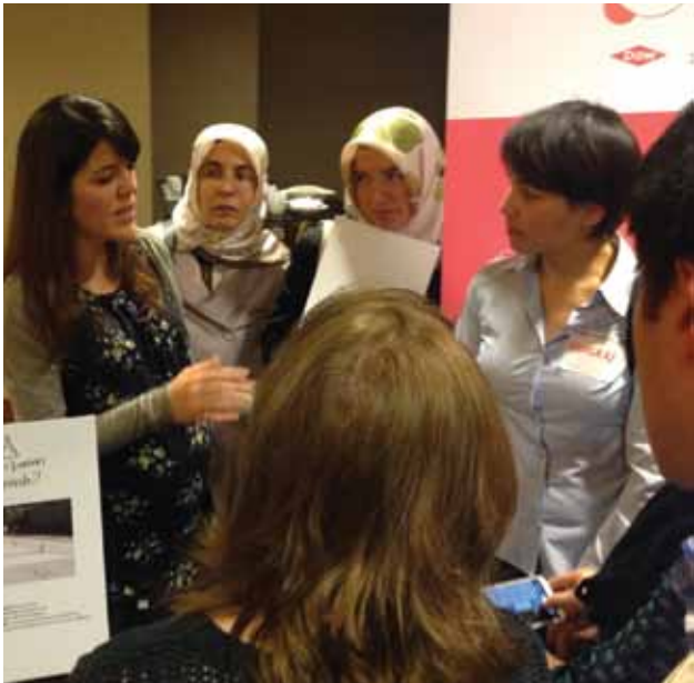
Dow employees showed teachers how chemistry impacts their everyday lives during the Chemistry of Teaching event May 10 and 11.