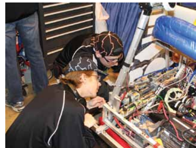
Team members work on their robot during the time between rounds of competition.