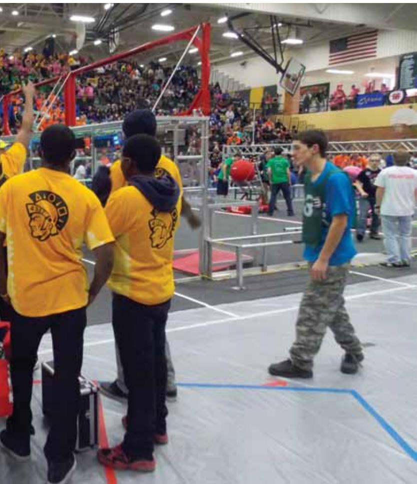
Members of Saginaw High’s Team Trobot look up at the packed house in the stands of Dow High School in Midland, Mich., as they prepare to compete in the Great Lakes Bay Region FIRST Robotics district competition.