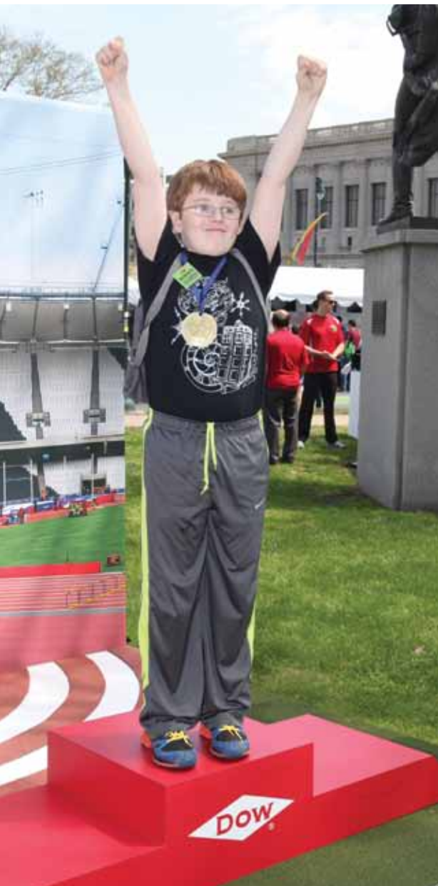
A young visitor to the Philadelphia Science Festival experiences the thrill of victory on a mock medal stand.

PENNSYLVANIA: As a global Olympic sponsor, Dow has a unique ability to combine the thrill of sports with the wonder of science. It all came together at the 2014 Philadelphia Science Festival, April 25 through May 3.