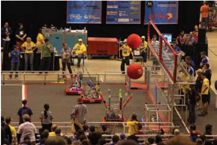
Team 2619’s robot fires a shot at the goal during the FIRST Robotics Championship.