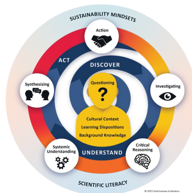
Figure 2: Global Goals Action Progression.

Finally, young people apply both their existing knowledge and their newly gathered information. First, they consider personal changes they could make to help make their communities more