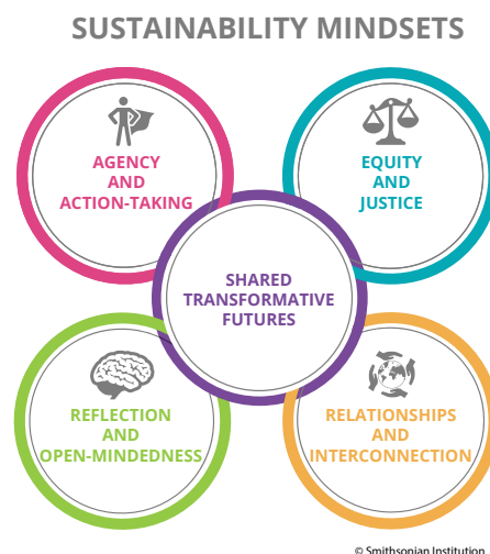
Figure 1: Sustainability Mindsets.

Learners use scientific and socio-scientific investigations to understand their local communities, scientific principles, and innovation possibilities. They then have a chance to immediately apply this information to make decisions that are informed by the results of their investigations. Along the way, young people are prompted to reflect, investigate, think critically, analyze, and build consensus. Engaging in these activities builds important skills of empowerment and agency, open-mindedness and reflection, equity and justice, and global-local interconnection. These sustainability mindsets prepare young people to take an active role in shaping the future of their communities and their world.