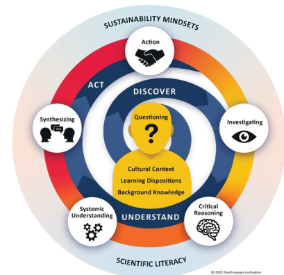
Figure 2: Global Goals Action Progression.

Finally, young people apply both their existing knowledge and their newly gathered information. First, they consider personal changes they could make to help make their communities more